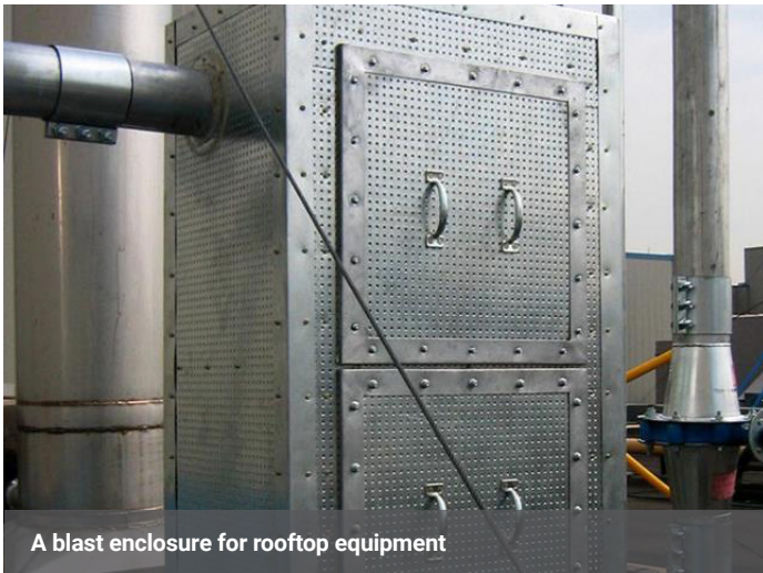
A blast enclosure for rooftop equipment

Blast Resistant Enclosures Protect Personnel, Equipment and Machinery