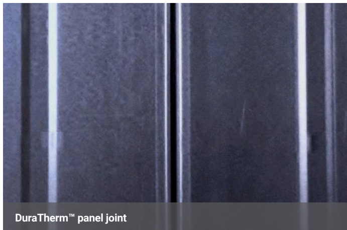
DuraTherm™ panel joint